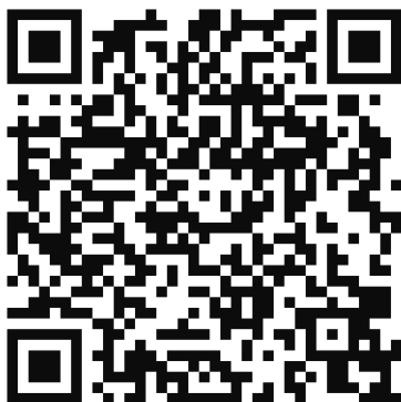
Armorgators Contest Website